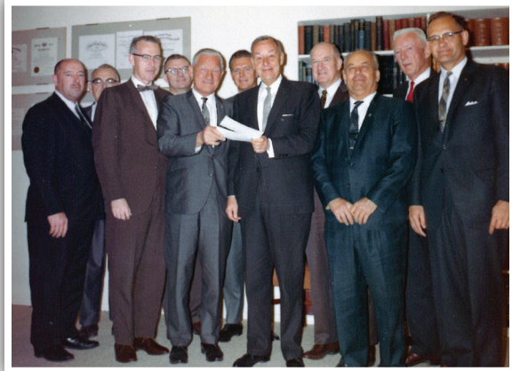
SCWUA presents $10,000 check to USC

With an ever-growing number of state, local and other agencies becoming involved in the Foundation, the Southern California Water Utilities Association (SCWUA) helped the Foundation establish the membership program in 1967, ensuring a financial base for continued operations. The membership program helps fund the day-to-day operations of the USC Foundation. Now for over 45 years the Foundation membership program has helped the Foundation to maintain its strong leadership in backflow prevention and cross connection control.