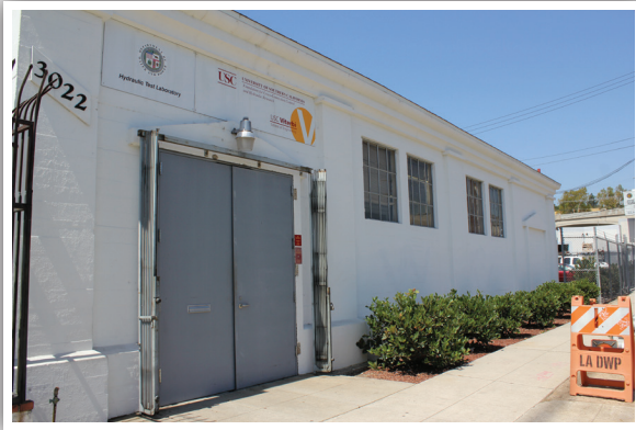
USC Foundation Laboratory

In April 1965, LADWP provided the laboratory new equipment that the Foundation could use for its continued operation and testing of devices. Not only can it be used to evaluate backflow prevention assemblies, but also to conduct specialized research, which may require the laboratory's systems and large water flow capacity. The location continues to be home of the Foundation Laboratory.